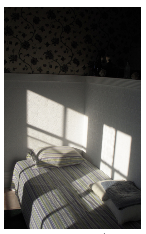
A QUAINT BEDROOM IN ONE OF GREGORY'S UNITS

largest challenges returning men and women face. Unfortunately, there are landlords and property owners who are unwilling to take on a person because of their criminal record. Even Gregory,