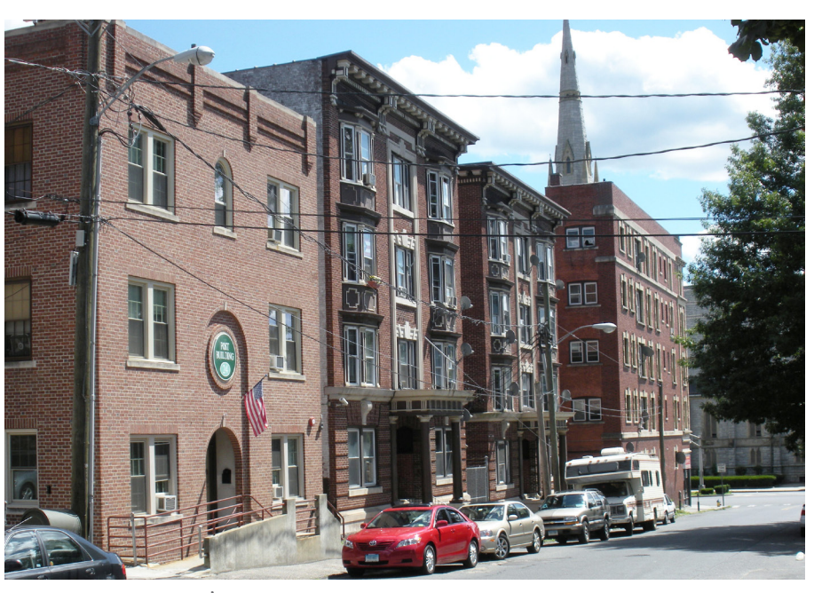
THE SITE OF CT RENAISSANCE'S WORK RELEASE PROGRAM

When asked about what she would change about the correctional system the house is currently operating under, Kacy explains, "I would change the process of meeting the client's substance abuse and mental health needs first before they have to deal with the pressures of employment."