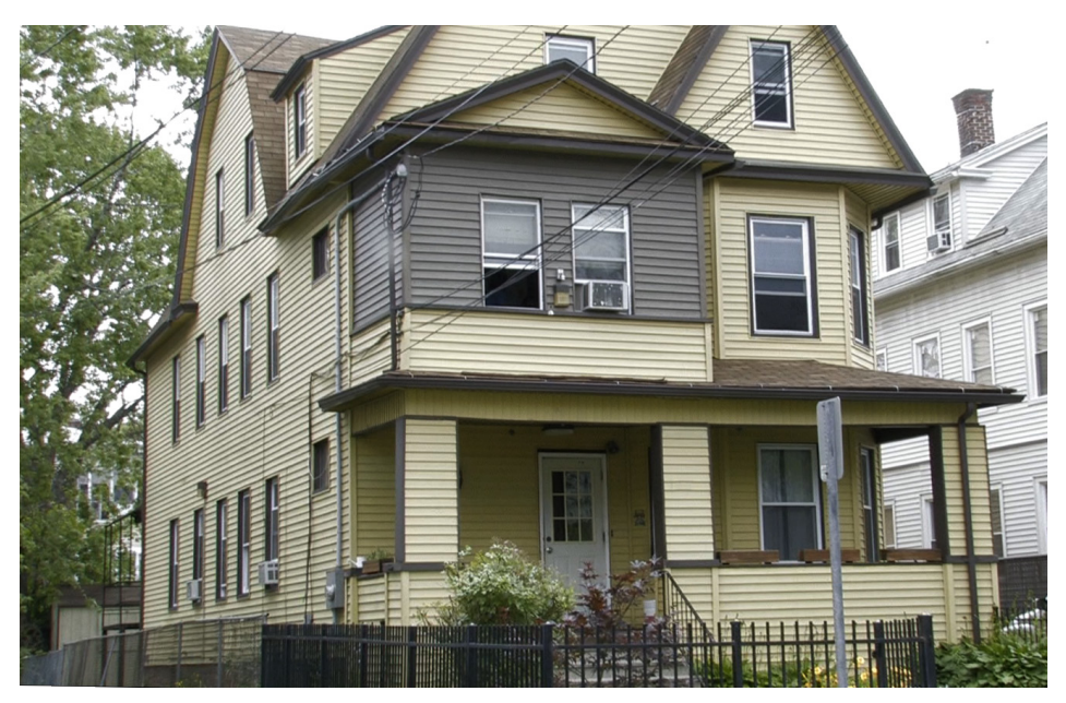
THE HARTFORD HOUSE: AN AVERAGE EXTERIOR GIVES WAY TO A POWERFUL INTERNAL NETWORK OF SUPPORT

their rooms by eleven, and in twelve hours they will begin it all again.