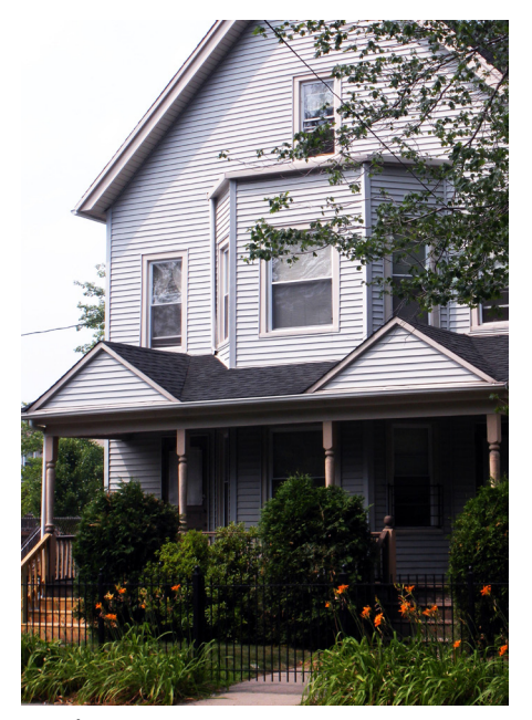
MART'S HOUSE, OPERATED BY COMMUNITY PARTNERS IN ACTION, HARTFORD, CT.

Community Partners in Action was established in 1875. Originally named Friends of the Prisoners Society, it was