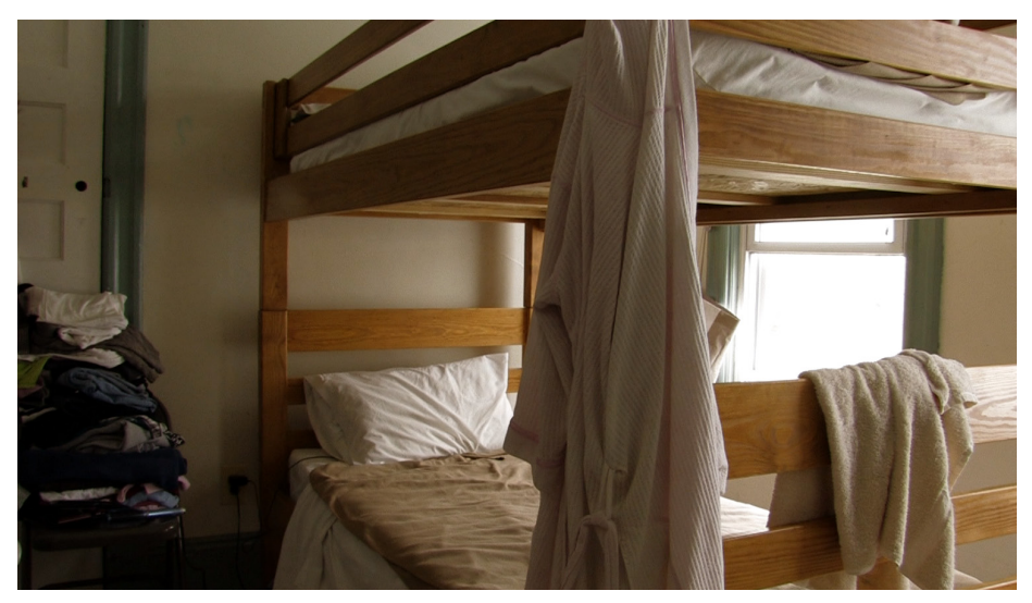
MINIMALISTIC WOODEN PIECES FURNISH THE BEDROOMS IN THE HARTFORD HOUSE

program and the support services that accompany it.