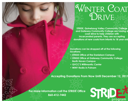
STRIDE'S WINTER COAT DRIVE FLYER