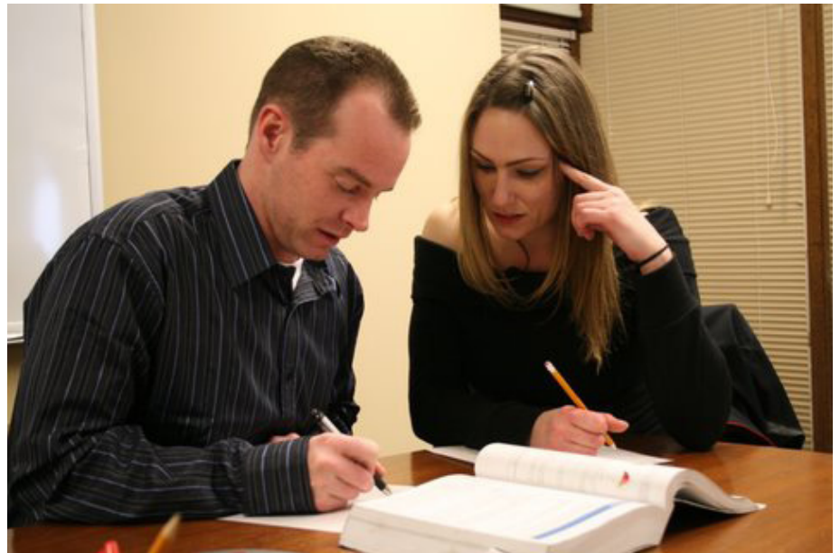
FORMER STUDENTS HELP EACH OTHER STUDY AT THE POST-PRISON EDUCATION PROGRAM OFFICE