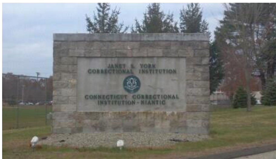
YORK CORRECTIONAL INSTITUTION'S FRONT ENTRANCE

"We are a paradoxical nation, enormously charitable and stubbornly unforgiving. We have called into existence the prisons we wanted. I am less and less convinced they are the prisons we need."