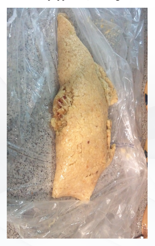
A homemade mofongo

a garbage bag along with a cup of water. Next, we mashed the crumbs into a salty paste consistent with ground beef well past its expiration date. We spread the paste over the counter like pizza dough, and sliced up pepperoni with an expired driver's license – inmates use their I.D. cards as cutlery. We substituted canned cheese with Kraft shredded cheddar and added it into a third bag with boiled Raman noodles and chunks of pepperoni, mixing all of